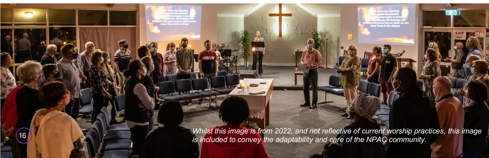
Whilst this image is from 2022, and not reflective of current worship practices, this image is included to convey the adaptability and care of the NPAC community.