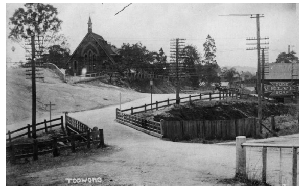
St Thomas' Toowong c.1917