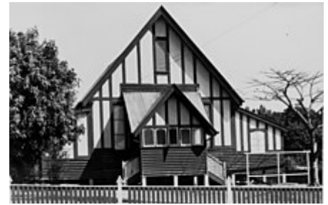
Figure 1: St Thomas Parish Hall c. 1940

In the early 1960s, a new low set brick rectory was constructed adjacent to the church, and this and the nineteenth century Sunday School and Parish Hall survived to the north of the church, although a fire in May 1970 gutted the school. By the 1980s, the upkeep on the rectory, Sunday school and hall (used for both church and community functions) was becoming too expensive, but equally the church could not afford to replace these buildings. In 1987, a commercial developer proposed to buy the land occupied by the rectory, Sunday school and hall and construct a large commercial building with the church having use of part of the building for its purposes with an off-site rectory (High Street having become too noisy and commercial). This was a controversial proposal within the congregation, but it was agreed to proceed, but the overall development was cancelled due to the downturn in the property market. However, the concept remained alive within the congregation and a similar commercial development arrangement was completed in 1998 with a parish centre established as part of a larger commercial building.