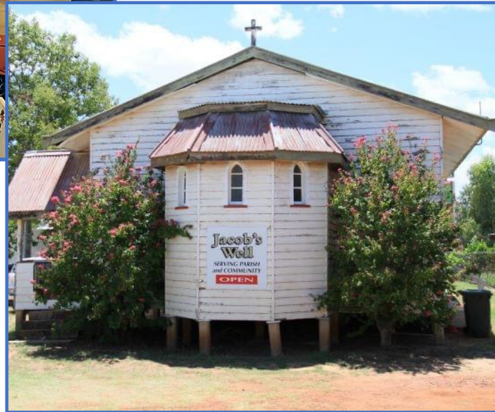
Jacob's Well Op Shop.