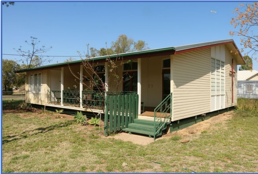
St Anne's Anglican Church, Thallon

St Anne's Anglican Church currently had an ecumenical service supported by the Catholic Church.