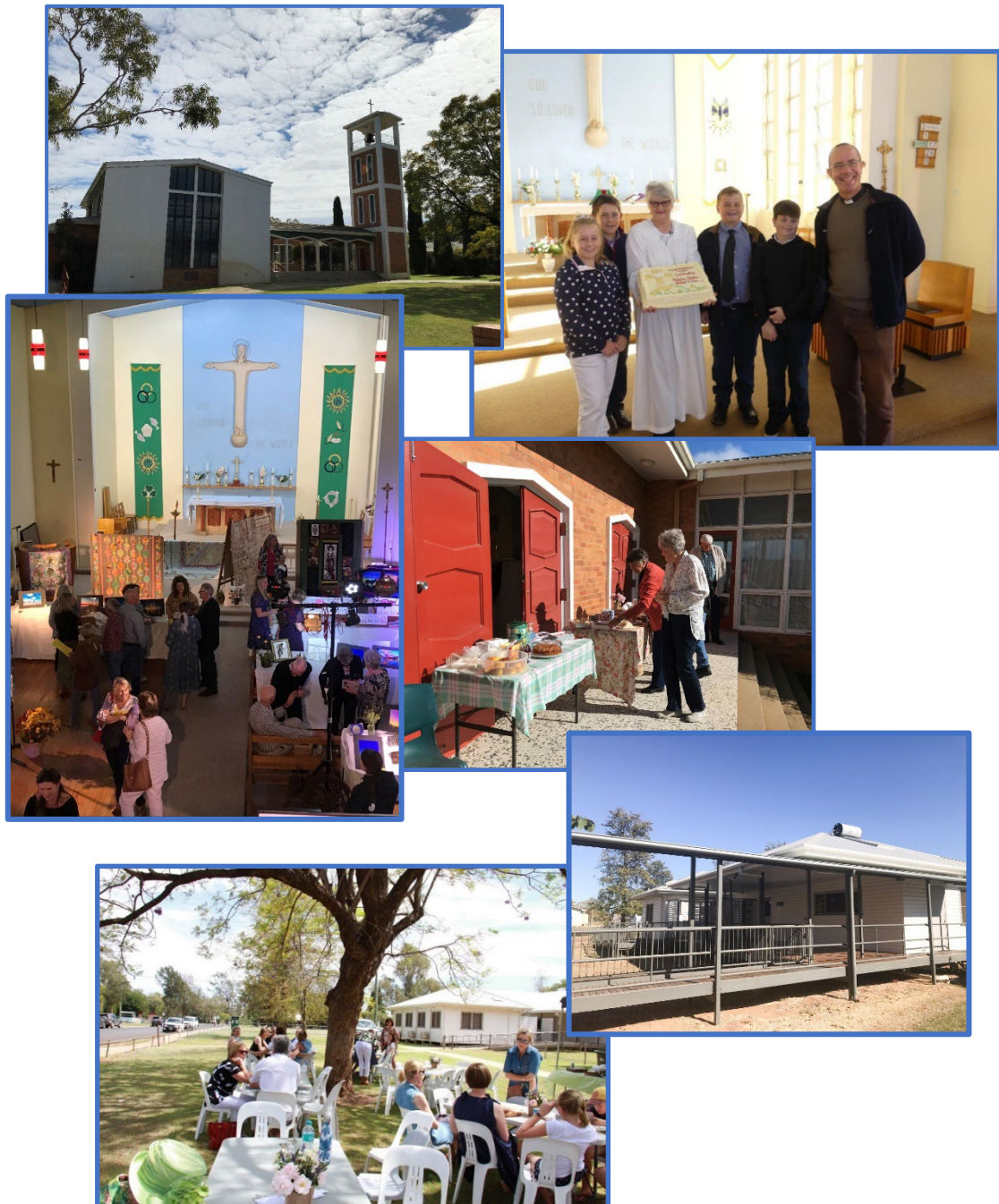
Christ Church, St George

The rectory is a large house with 3 bedrooms and an office. It has recently had air conditioning upgraded and the interior and exterior painted and the carpeted floor covering will be replaced soon.