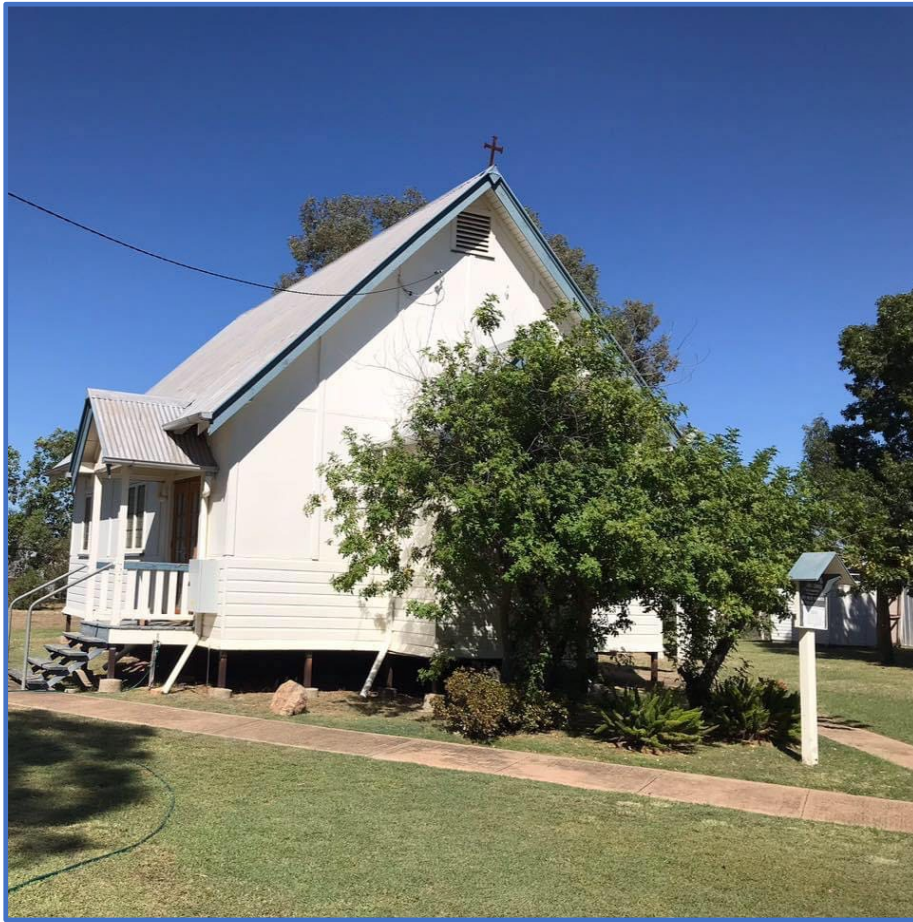
St Mark's Anglican Church Dirranbandi

St Marks Anglican Church currently offers a service once a month. It has an Op Shop next door.