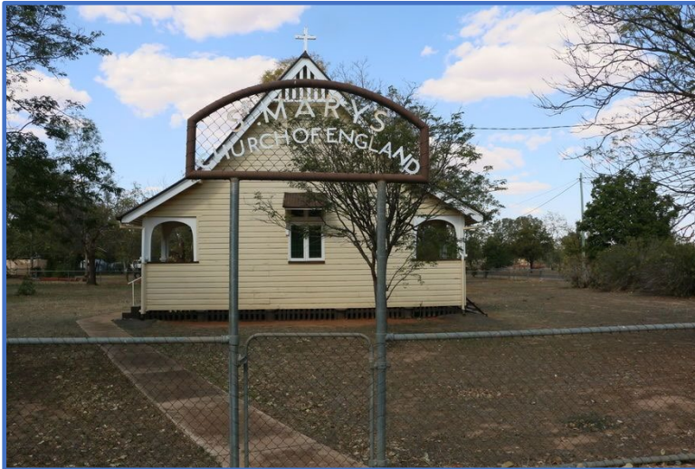
St Mary's Church, Bollon

Bollon is a rural town in the Balonne Shire in the 2016 Census the population was 221 people. Bollon is situated approximately 114 km west of St George along the Wallum Creek a beautiful camping spot and home to Koalas. The town is thought to be named after the Mandandanji language word balun or balonn meaning water or a running stream .