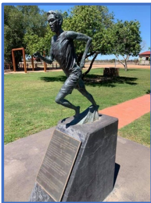
Statue of runner Tom Dancey, Railway Street Park (2021).

The Culgoa Floodplain National Park lies 130 kilometres to the south-west.