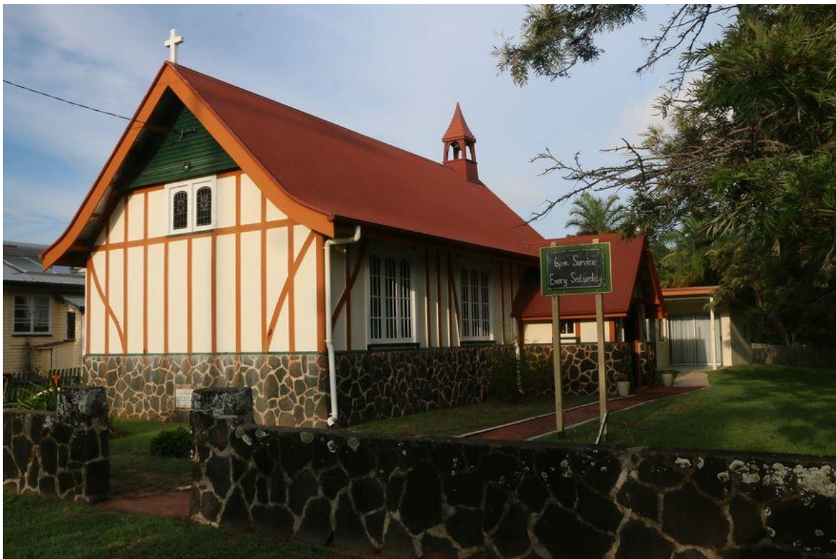
St John the Divine, Burnett Heads

There have been 7 small churches in the Parish that have been sold in the past thirty years: Gooburrum, Sharon, North Bundaberg, Kensington, Thabeban, East Bundaberg and Buss Street Bundaberg. There have been no discussions about the closure of any more churches.