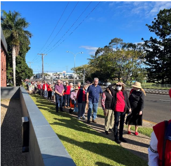
"Church Crawl", Day of Pentecost, 2022

The Parish maintains strong links with other churches in the community. The clergy regularly attend the Bundaberg Ministers' Association monthly meeting and they participate in ecumenical religious education in local State primary schools. Three times a year there is a combined churches service at the Bundaberg Christian College and the clergy and people of the Parish have been invited to attend. An important ecumenical endeavour is 'Bethlehem Live', a recreation of biblical Bethlehem in the yard of Bundaberg Central State School. Due to the coronavirus pandemic, 'Bethlehem Live' did not operate in 2020 and 2021. The Ministers' Association intends to resume the event in December 2022 and the people of the two Anglican parishes will be participating.