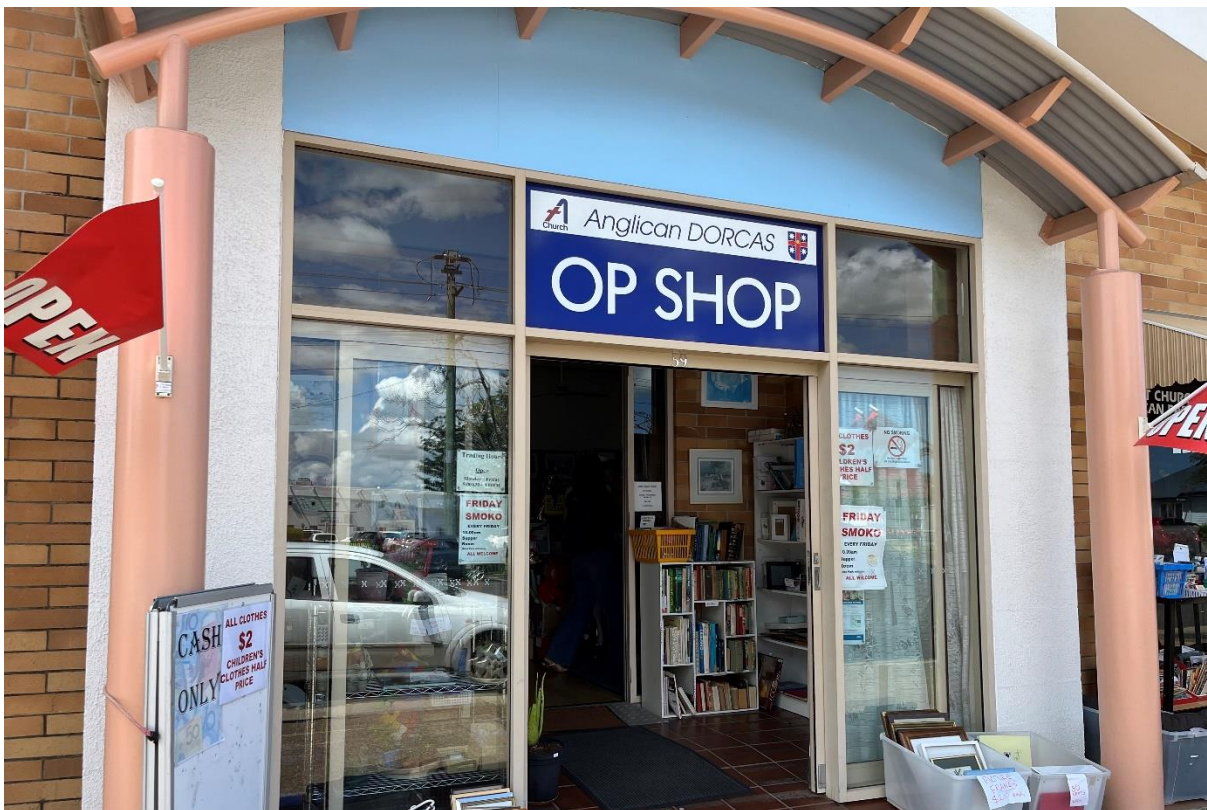
Parish Hall (top) and Op Shop exterior