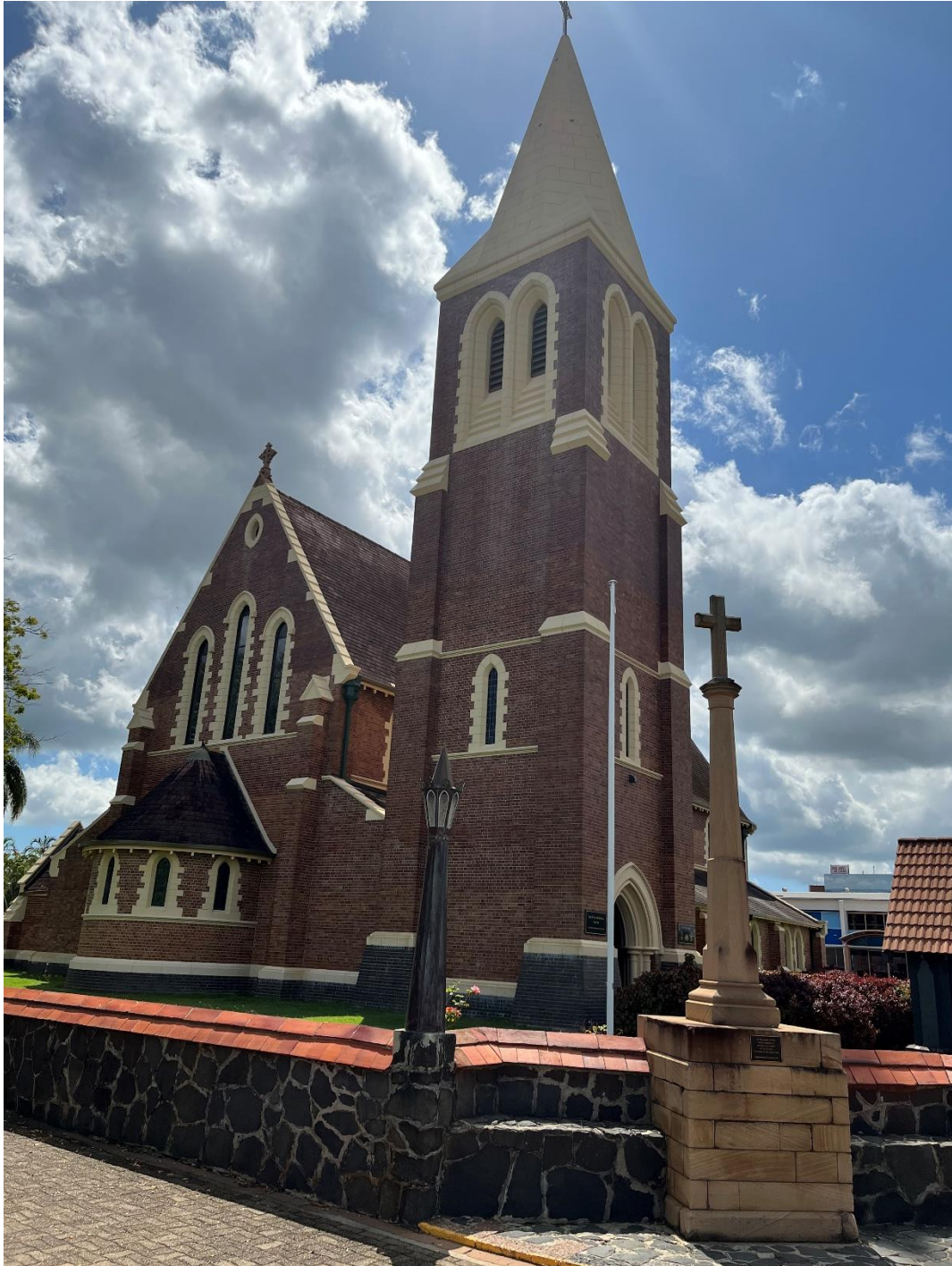
Christ Church Bundaberg