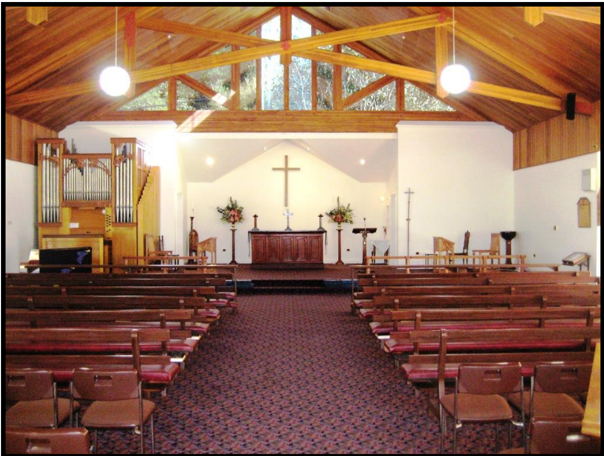
St George's Church Interior

“Living in the way of Christ with faith and loving service and working together towards the future with hope”