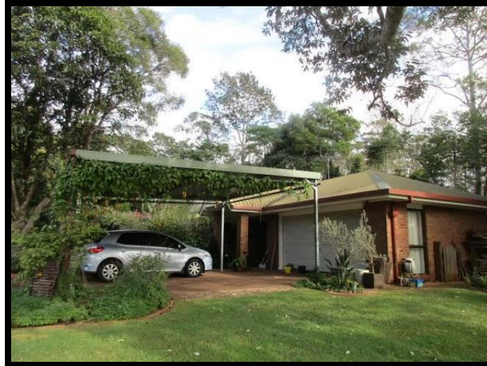
Rectory & Parish vehicle

The rectory is situated on the same parcel of land as St George's church. It was constructed of brick veneer in 1990 and has 4 bedrooms, study, 2 bathrooms, lounge, dining, family room, 2 car garage and double carport. The kitchen and floor coverings have been recently refurbished and the family room air conditioned.