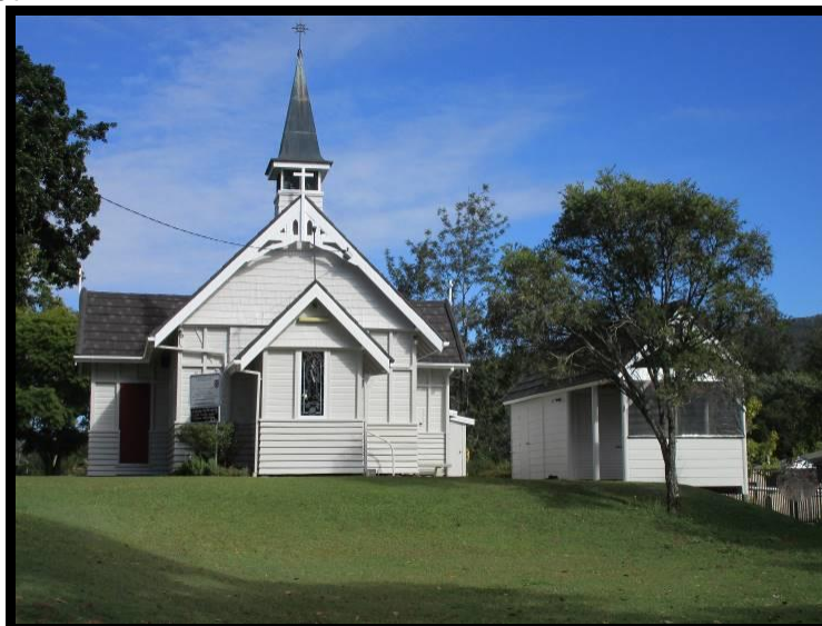
St Luke's Church

St Luke's church in Canungra was built in 1936 and seats 40 people. It is also architect designed, built from local timbers and has local heritage status. It has a pavilion with tea making facilities, 2 store rooms and toilet