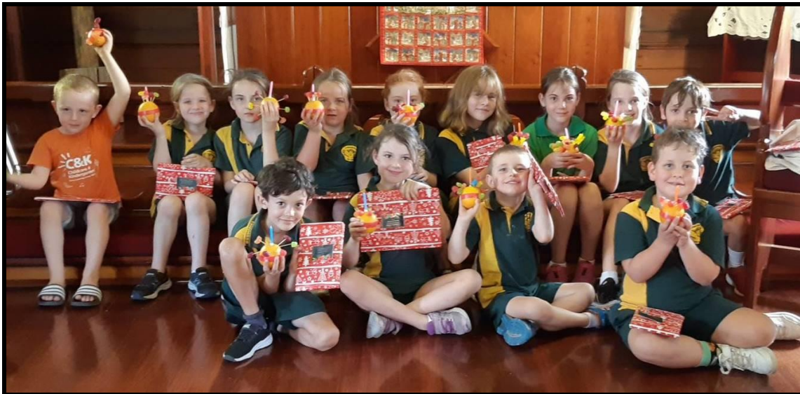
Little Lukies at their Christmas breakup