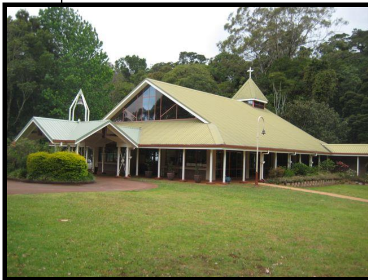
St George's Church

The principal church is St George's on Tamborine Mountain which was built in 1992 and seats 200 people. It is architect designed in modern brick and glass construction. There are 2 timber halls, a kitchen and toilet block which pre-existed the main church.