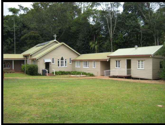
Georgian Room, deVoil Room & Toilet Block

The church hall (Georgian Room) was the main church until 1992 when it was renovated to include a kitchen. It is linked to the church with a covered way. The Sunday school room (deVoil Room) is connected to the Georgian Room and is of similar vintage. It has tea making facilities.