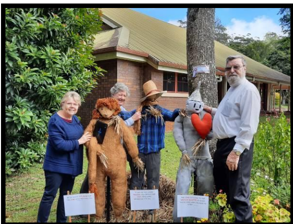
Scarecrow Festival 2020