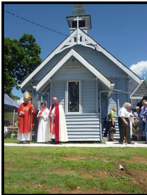
St Luke's consecration 2011

Services have been held in Canungra since 1908 and St. Luke's church was constructed debt free and dedicated in 1936. St. Luke's was consecrated at its 75 th anniversary in 2011.