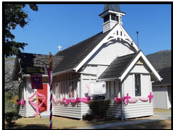
St Luke's turns Pink for Breast Cancer in October