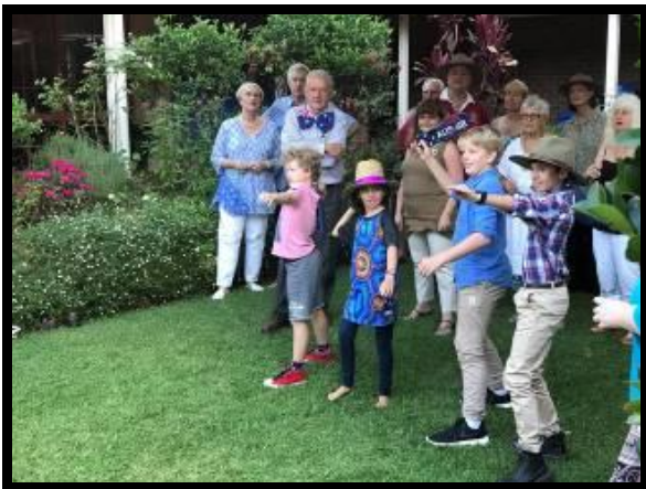
Australia Day 2019

St George's grounds are now mowed & gutters cleaned regularly by a contract groundsman and the gardens are kept in trim by a small band of parishioners from St George's and a paid gardener. St Luke's grounds are mowed regularly and maintained by St Luke's congregation volunteers.