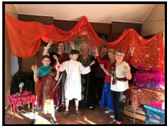
Bollywood Fund raiser 2018