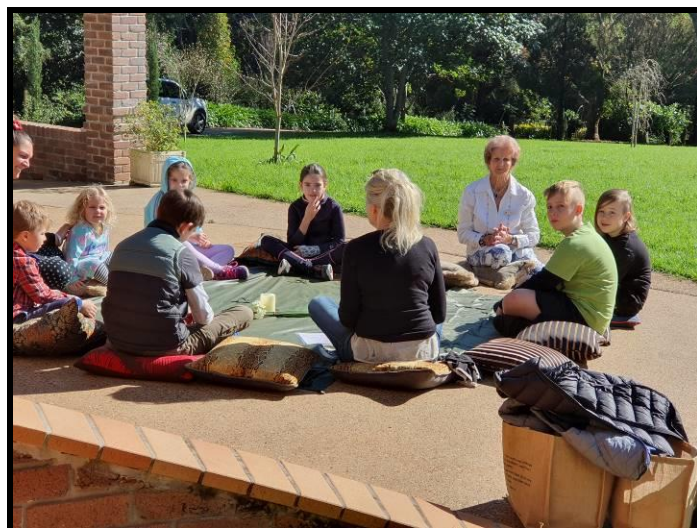
Children's Meditation at St George's