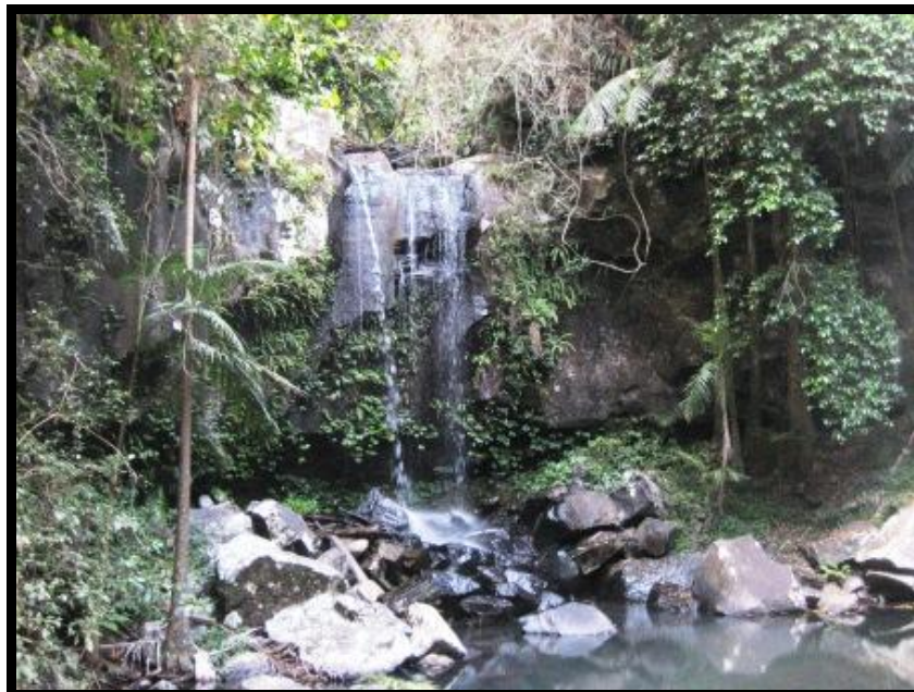
Curtis Falls – 700m walk from Rectory